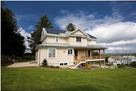
Single Family Residence LEED® Platinum

Hello everyone. As fall winds its way down, we have some great news to share.