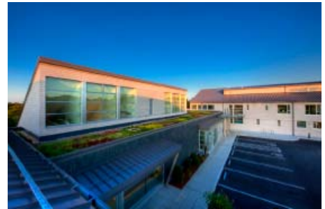
Potter League for Animals LEED® Gold 1 st in the Nation!