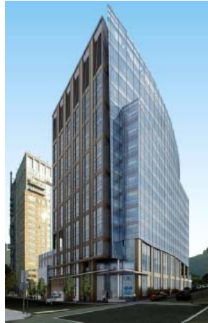
Blue Cross & Blue Shield of RI LEED® Silver Office *pending